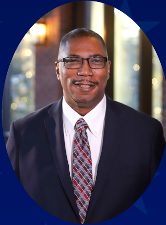
Craig Newton Mayor